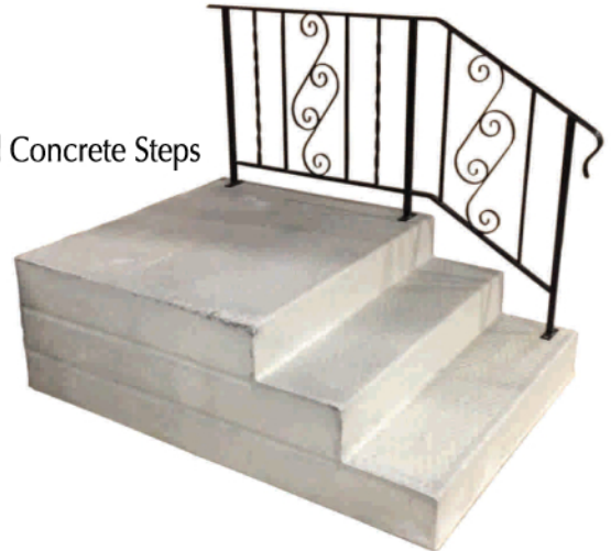
Standard Concrete Steps

Salt or other deicing chemicals should not be used on concrete steps. We suggest using sand for improved step traction.