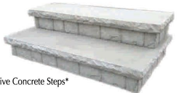
Decorative Concrete Steps*

Salt or other deicing chemicals should not be used on concrete steps. We suggest using sand for improved step traction.