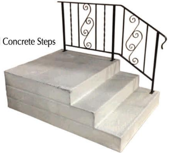
Standard Concrete Steps