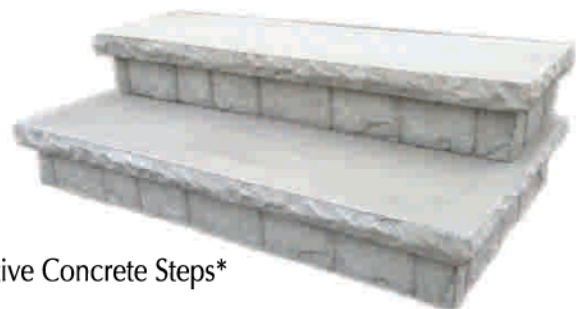
Decorative Concrete Steps*